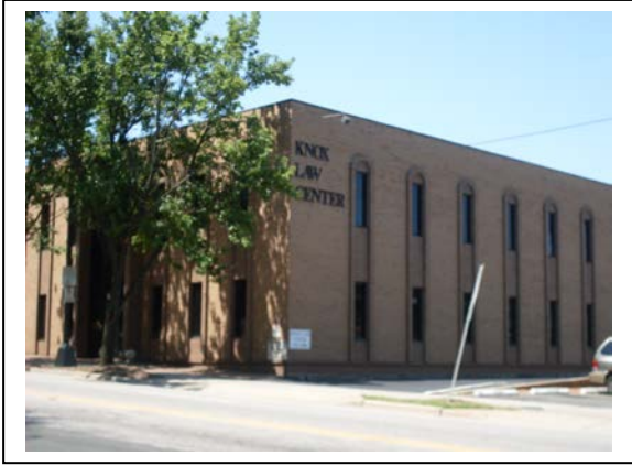
Knox Law Center 817 East Trade Street Charlotte, NC 28202 P - (704) 372-1360 F - (704) 372-7402