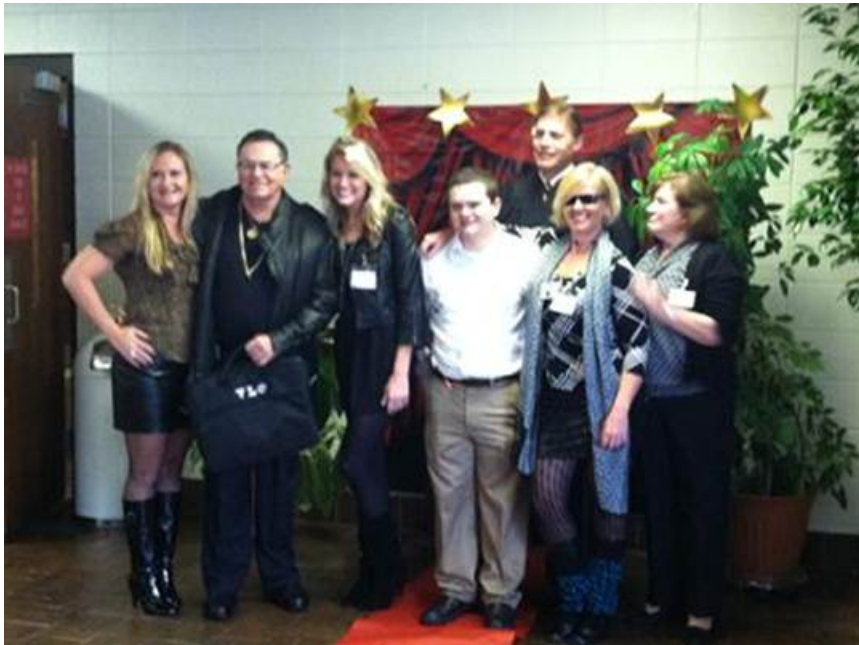
KBKG as “ My Cousin Vinny ” Cast at the Lincoln County Chamber Annual Business Expo

Participants in this year’s Lincoln County Business Expo were encouraged by the Lincoln County Chamber to choose a movie theme for their booth and for their participants to dress as characters out of the chosen movie. The Knox Law Center, whose satellite office is in Lincoln County, chose the movie “My Cousin Vinny” and the attorneys and office staff dressed accordingly. Each year our firm participates in the Lincoln County Business Expo to support local businesses and to make the community aware of legal issues. The expo is free and open to the public with the goal of educating those in the community about businesses in Lincoln County. We support small businesses and represent many of them in our practice, doing incorporations, contract reviews, lien issues, and much more.