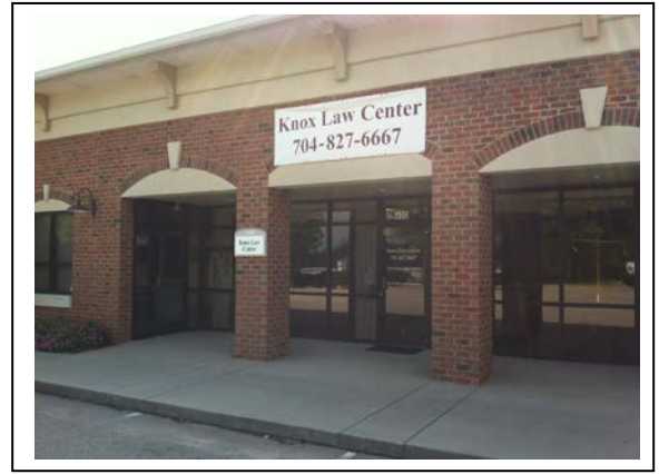
Knox Law Center 7476 Waterside Loop Road Denver, NC 28037 P - (704) 827-6667 F - (704) 372-7402

The information in this email should not be construed as legal advice and no attorney-client relationship is established with the firm of Knox, Brotherton, Knox & Godfrey through receipt of this email. The firm of Knox, Brotherton, Knox & Godfrey does not support or endorse the policies, services, or information offered by the web site links in this email.