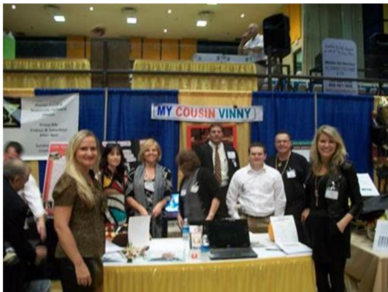
KBKG Expo Booth